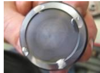
Fig. 2 Wetting the disc