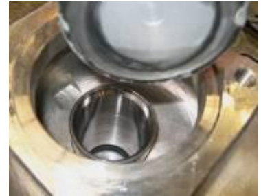
Fig. 3 Re-lapping with a glass plate