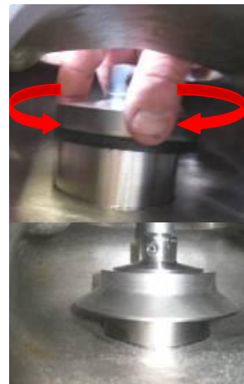
Fig. 3 Lapping the seat and disc