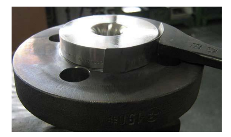
Fig. 3 Installing the nozzle