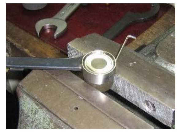
Fig. 4 Installing the snap ring